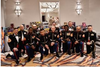
Marines from MACG-48 at Gala

For over 50 years, Glenview Council has been hosting a Gala to raise funds for Marine Control Group 48's Toys for Tots Drive. On November 19, 2022, the Gala was held at the Chicago Hilton in Northbrook, and was a smashing success! Marines use funds from the Gala to purchase more toys to distribute to children in the area who might not otherwise have a Christmas. We are all familiar with the Toys for Tots collection boxes we see in public places around town. As we learned a few years ago, donations do not always match up with needs. It is much easier to pick out a toy for a toddler than a teenager (and cheaper!). Consequently, there would be unmet needs were it not for funds raised by Glenview Council and other organizations. From our gala, we donated $5,000 to MACG-48 to purchase toys.